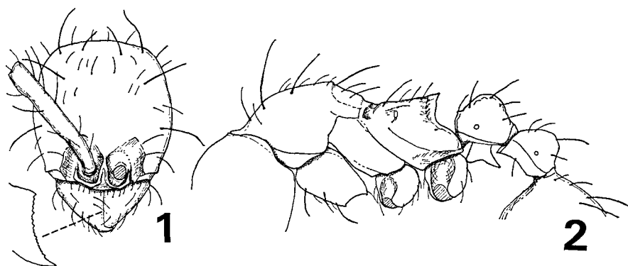
Figs. 1-2. Aenictus hottai n. sp., worker; 1, head; 2, mesosoma, petiole and postpetiole.

Remarks. The present new species is easily distinguished from the other known species of this genus by broader and triangular mandibles, absence of "Typhlatta spots" and developed subpetiolar process. One of the specimens is tinged with orange and is much brighter than the holotype.